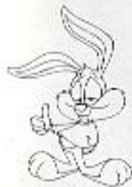
PLAYER: BUSTER BUNNY

HINT: When you reach a doorway, stand in front of it and press the CONTROL PAD up to open it.